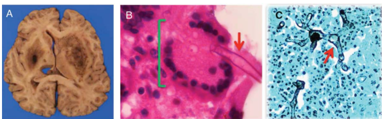
Figure 2 Pathology

(A) Gross histologic section of brain showing hemorrhage and necrosis in the bilateral basal ganglia. (B) Microscopic histologic section from the left basal ganglia showing multinucleate giant cell (green bracket) and a broad aseptate fungal hyphae (red arrow) consistent with mucormycosis (hematoxylin & eosin, 1,000 \times magnification). (C) Branched, aseptate hyphae (red arrow) highlighted by Grocott methenamine-silver stain (400 \times magnification).