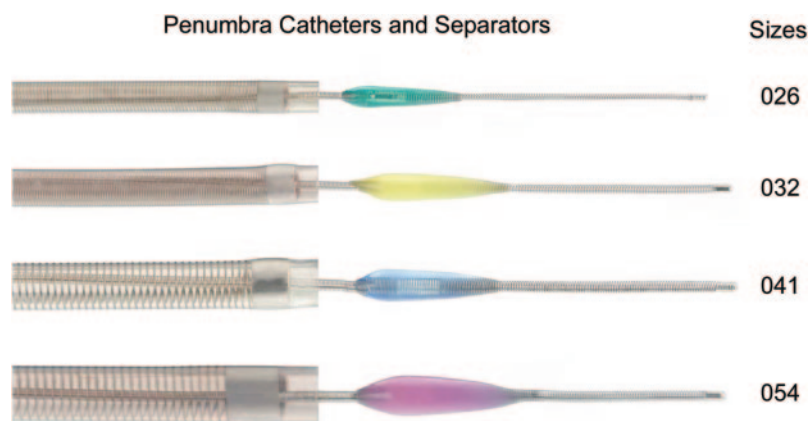
Figure 1 Penumbra catheters and separator

tion rate (thrombolysis in myocardial ischemia [TIMI] scores of 2 and 3 [TIMI2 and TIMI3]) of 46% by device alone and 60.8% by combination of the device and chemical thrombectomy. SICH occurred in 7.8% (X series). 21 The Multi-MERCI trial further evaluated the safety efficacy of the first-generation device and collected safety and technical data for second-generation devices (X and L series). The recanalization rates went up to 52% by device alone and 68% by device and tPA combination; SICH occurred in 9.8% of patients. These improvements were attributed to enhanced experience with using a device and modification in design. Because patients receiving IV tPA without recanalization were also included, this trial showed safety of Merci retrieval post-thrombolysis. 22