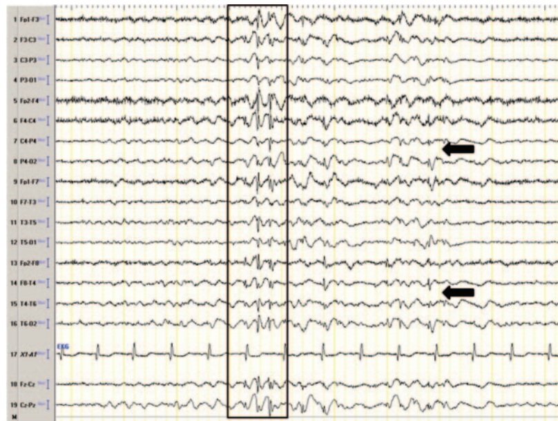
A generalized fast spike-wave burst (boxed) with right hemispheric maximum, followed by right hemispheric spike fragments (arrows).