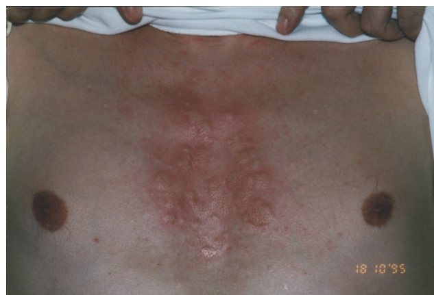
Figure. A maculo-papular urticarial, non-itching skin lesion on the anterior chest occurring during every attack in a 51-year-old man with migraine without aura since childhood.