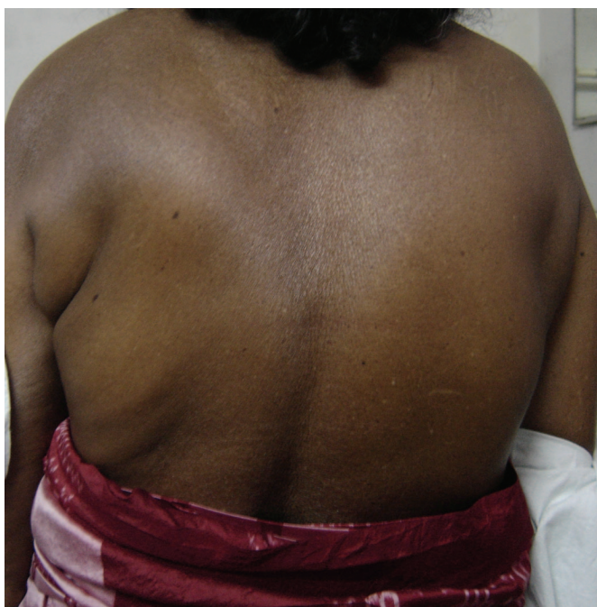
Figure 1. Contraction of the left latissimus dorsi muscle producing an accessory posterior axillary fold.