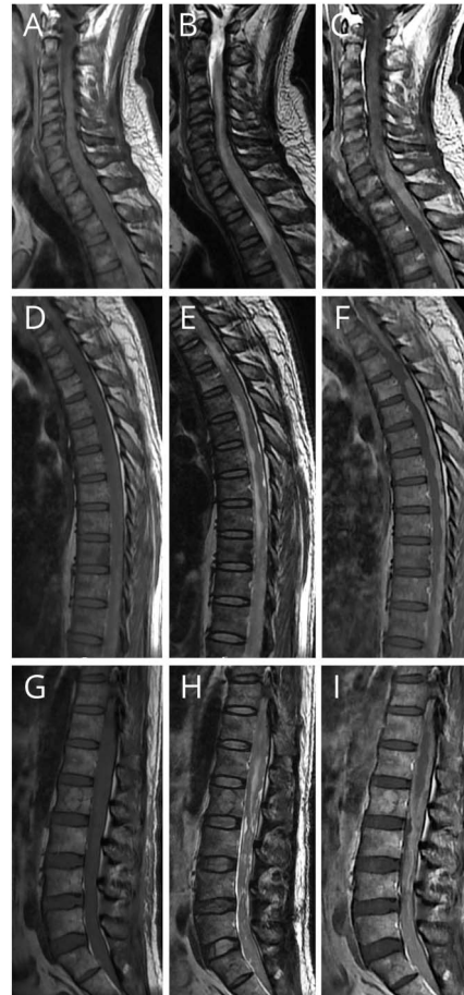
Figure 1 Spinal Cord MRI

(A-C) Cervical T1WI, T2WI, and enhanced spinal cord MRI. (D-F) Thoracic T1WI, T2WI, and enhanced spinal cord MRI. (G-I) Lumbosacral T1WI, T2WI, and enhanced spinal cord MRI.