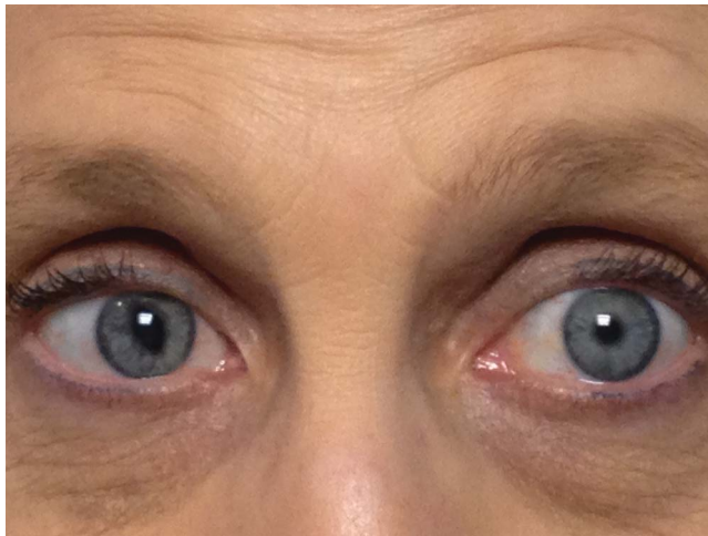
Figure 1 Close-up shows normal left pupil and tonic right cat's eye pupil

A 55-year-old woman noticed that her right pupil was oddly shaped, associated with a mild ache. Her afferent visual examination, ocular and eyelid motility, and fundi were normal. Her left pupil was round and reactive (figure 1). The right pupil was elongated (points at 11:00 and 5:00) and tonic (figure 2). There was no ocular hypertension or corneal edema. A year later, the pupil shape became triangular; evaluation revealed ocular hypertension without corneal edema, confirming the iridocorneal endothelial (ICE) syndrome. This case is an unusual presentation of a cat's eye Adie-like pupil as the harbinger for ICE syndrome.