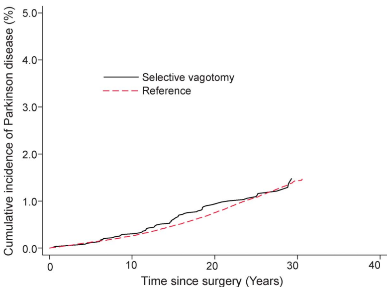
Figure 2 Cumulative incidence of PD among selective vagotomized patients and their matched reference individuals

Standard protocol approvals, registrations, and patient consents. The study was approved by the Regional Ethics Review Board in Stockholm. Because this study included analyses of deidentified data, written consent from participants was not required.