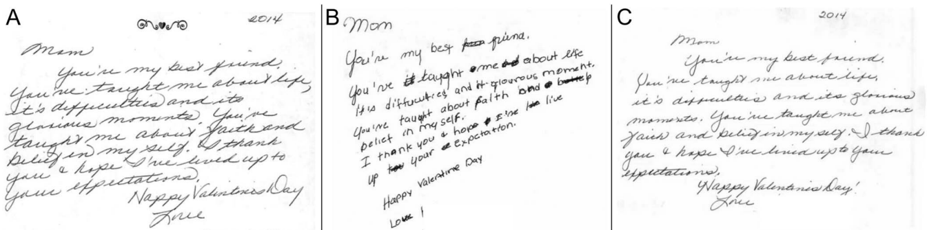
Figure 1 Patient's handwriting on 3 different occasions

Valentine's card handwritten by the patient (A) 1 month prior to presentation, (B) a handwritten copy produced by the patient at the time of presentation (after being asked to use her normal cursive handwriting), and (C) 5 days after resection of the skull-based metastasis.