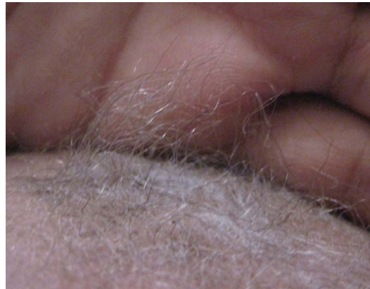
Figure 1 Characteristics of scalp hair in Menkes disease

Hair is sparse, short, thin, fragile, and light-colored, and has a steel-wool appearance.