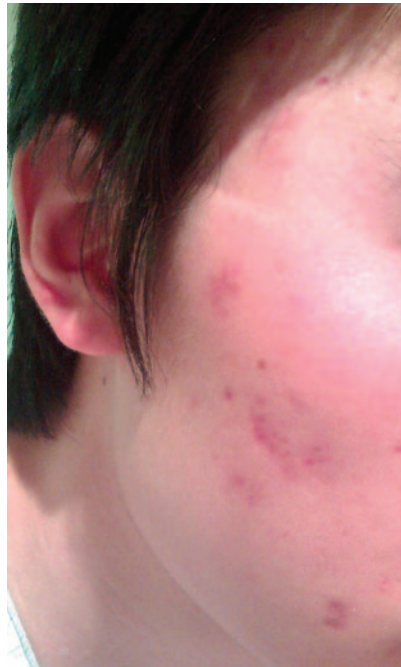
Figure 1 Photograph of patient with right facial mandibular distribution zoster

A 22-year-old man developed painful tongue swelling, a right facial rash, and right lower motor neuron facial palsy over 2 weeks. On examination he had a vesicular rash in a mandibular distribution and on the concha of the right earlobe, and right peripheral facial palsy (figure 1). T2-weighted MRI revealed high signal intensity in the spinal trigeminal tract (figure 2, A and B), and T1-weighted gadolinium-enhanced MRI revealed right facial nerve enhancement in the labyrinthine segment (figure 2C). MRI findings of spinal trigeminal nucleus and tract involvement in trigeminal zoster, 1 and of facial nerve enhancement in Ramsay-Hunt syndrome, 2 have been reported. Our patient developed trigeminal zoster and Ramsay-Hunt syndrome sequentially, and we confirmed corresponding abnormalities on MRI.