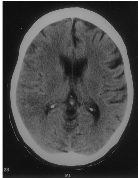
Figure. Unenhanced CT scan of head shows right hemispheric swelling and effacement of gyri on that side. Free parenchymal air is seen in the subfrontal region.

Case report. An 80-year-old woman presented with a history of progressive dysphagia, initially for solid foods and later for liquids, and severe weight loss during the previous 6 months. She was taking enalapril for hypertension. Initial investigations revealed the presence of a malignant stricture in the esophagus. She underwent an elective fiberoptic endoscopy under conscious sedation, which confirmed a malignant stricture at the esophagogastric junction, along with a small esophagotracheal fistula. Multiple small biopsies were performed, confirming the presence of esophageal carcinoma. Her level of consciousness deteriorated immediately following the procedure. She became unresponsive, but remained hemodynamically stable. Examination revealed a left hemiparesis involving the face, arm, and leg, with flexion of the right upper limb in response to pain. An emergent unenhanced CT scan of the head revealed parenchymal air in the right hemisphere (figure). Right-sided sulci were effaced, which was suggestive of an acute right middle cerebral artery infarct. Cerebral air embolism was diagnosed. She was treated conservatively with 100% oxygen therapy. A transthoracic echocardiogram with bubble contrast showed no evidence of a right-to-left intracardiac shunt. She was discharged from the hospital in a vegetative state 2 weeks after admission.